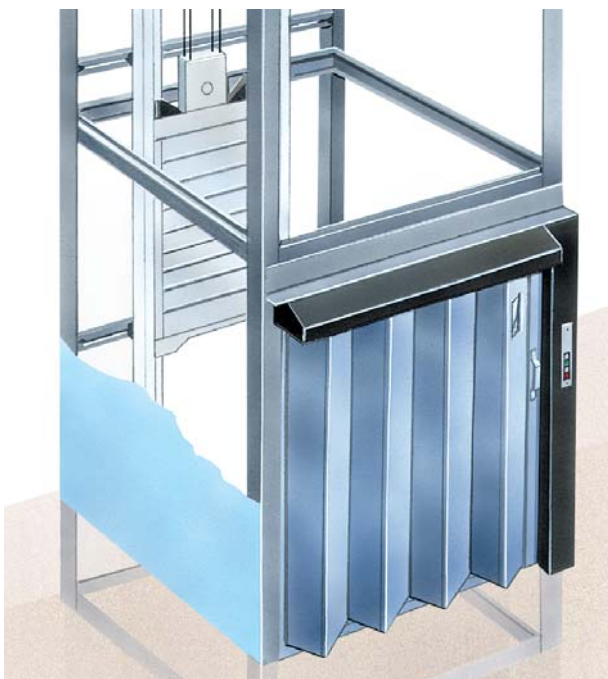
Illustration shows shutter leaf gate which can be installed as an optional extra

To protect loads during travel, a collapsible picket gate, electrically interlocked for safety, is available if required.