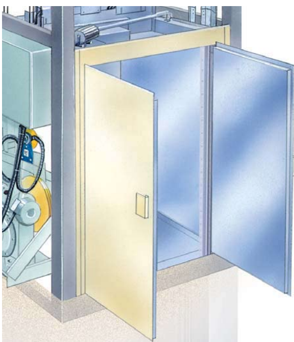
Double hinged steel door on 1305 and 1445mm wide cars

A collapsible gate is fitted to the lift car entrance as standard.